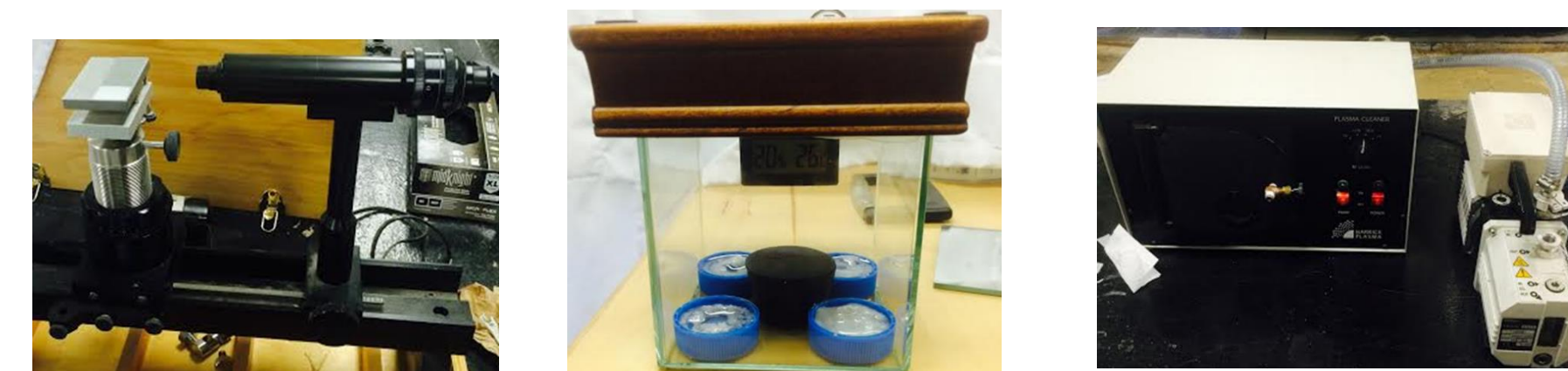
Figure two. (Left) Goniometer, (Center) Sealed humidity chamber, (Right) Plasma cleaning system